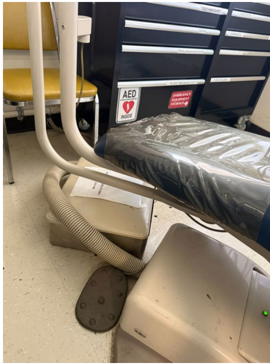
Leeward Health Center, Dental Clinic ~ Operatory #2